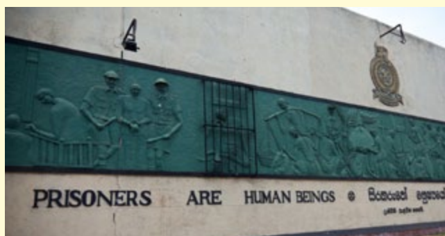
Welikada Prison in Colombo, Sri Lanka