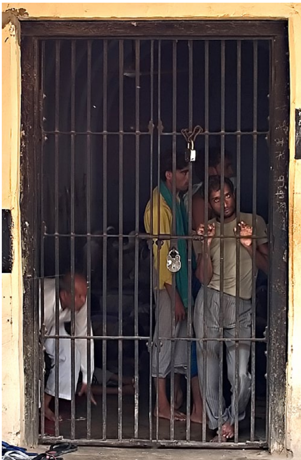
Inmates in an Indian prison cell