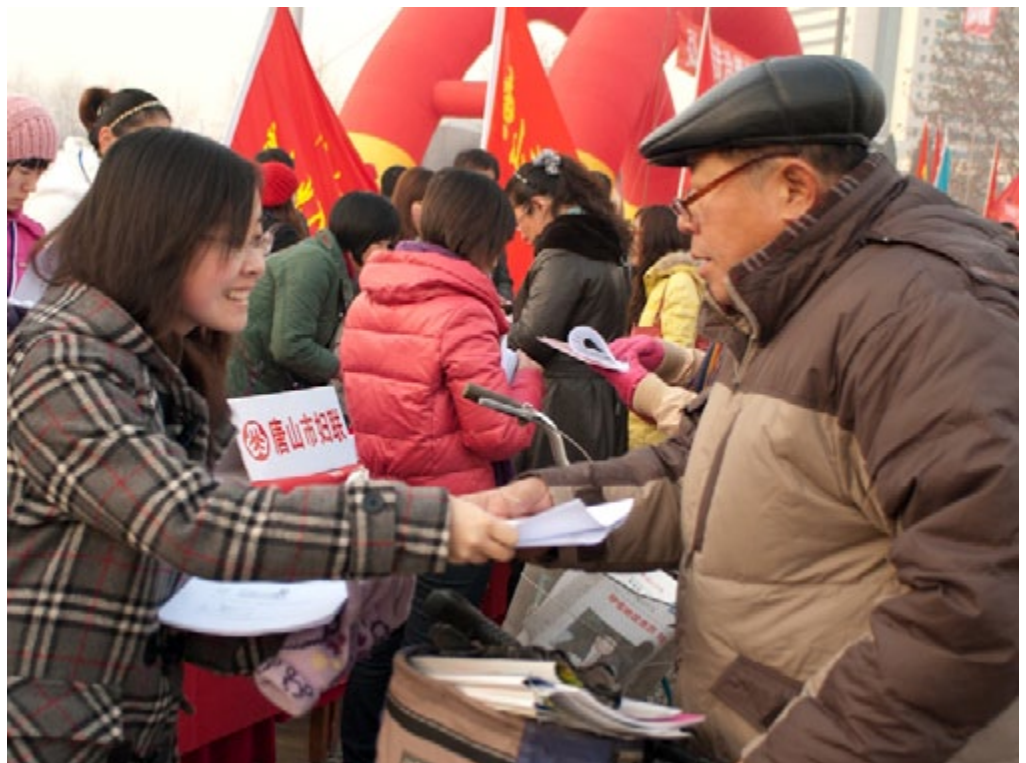
Law student distributing IBJ rights awareness materials

trainings on major legal reforms, including new rules on exclusion of illegally-obtained evidence announced in July and new sentencing guidelines announced in October. We held three trainings and two roundtables, led by some of China’s most respected legal thinkers, on the new evidence rules. We also held a conference in Suizhou, Hubei Province and a roundtable with judges