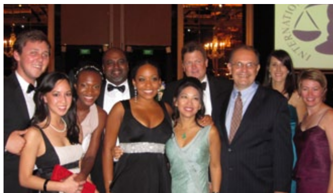
IBJ staff and volunteers at the Gala