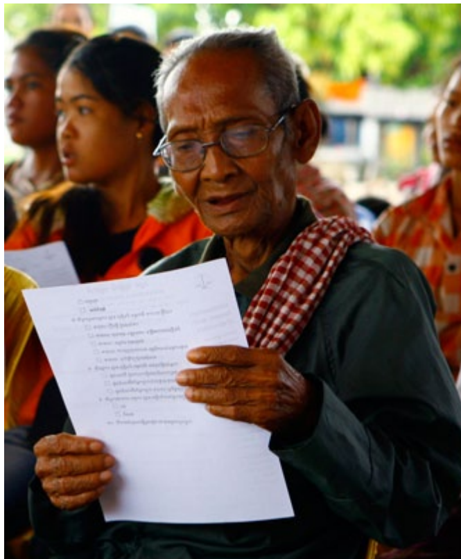
Man reads rights awareness material at a Street Law campaign in Pursat Province

In 2011, IBJ will work to expand this significant impact to a greater number of Cambodians in need of legal aid. Enlarging its current network of Defender Resource Centers into new territories and bolstering its support staff will allow IBJ lawyers to grow the legal aid community throughout the nation and bring about lasting change.