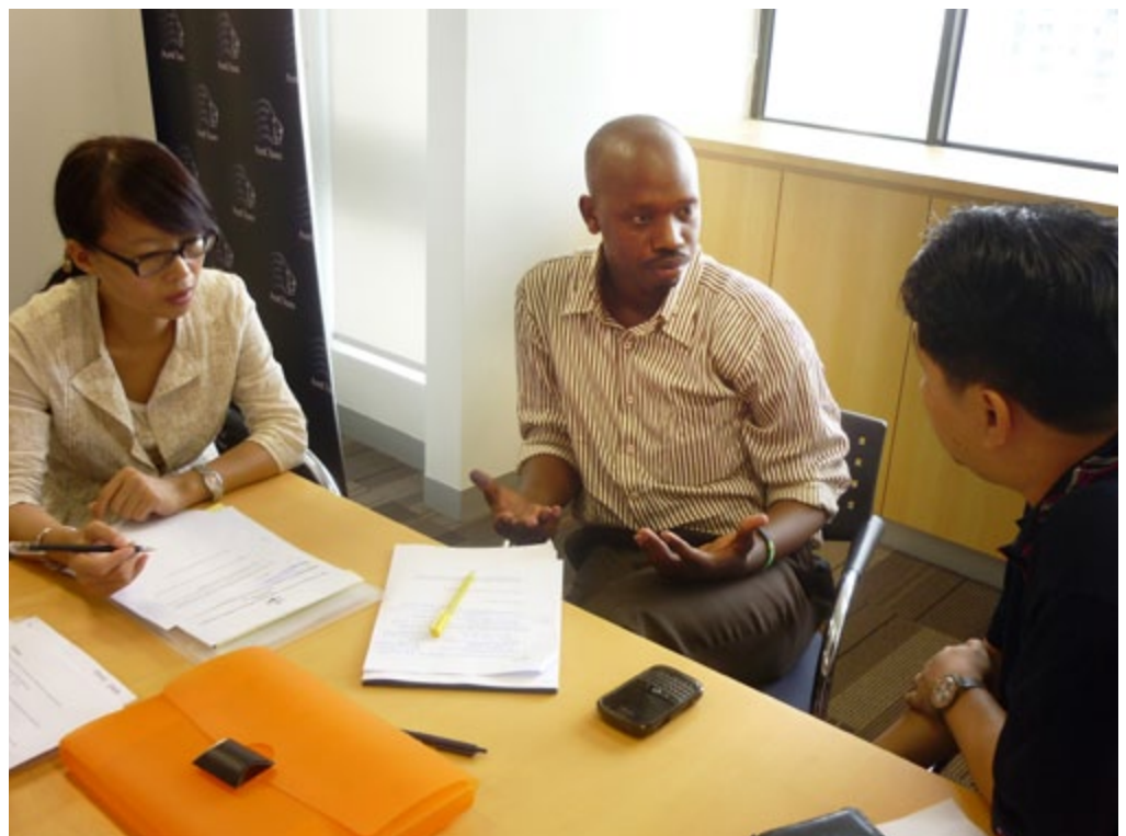
Left and above: Country and JusticeMakers Fellows at the Fellows’ Summit