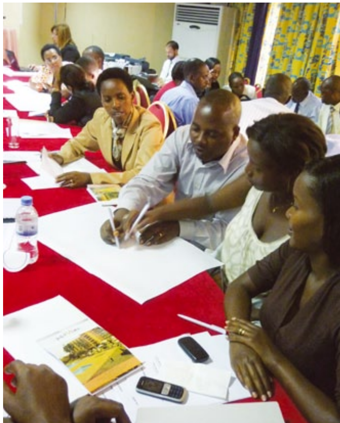
Lawyers engaged in discussion during an IBJ training