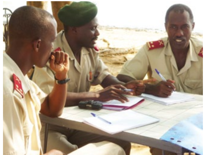
Military Court judges at a Burundi criminal defense skills training

rundi's detention policy. (See accompanying story.)