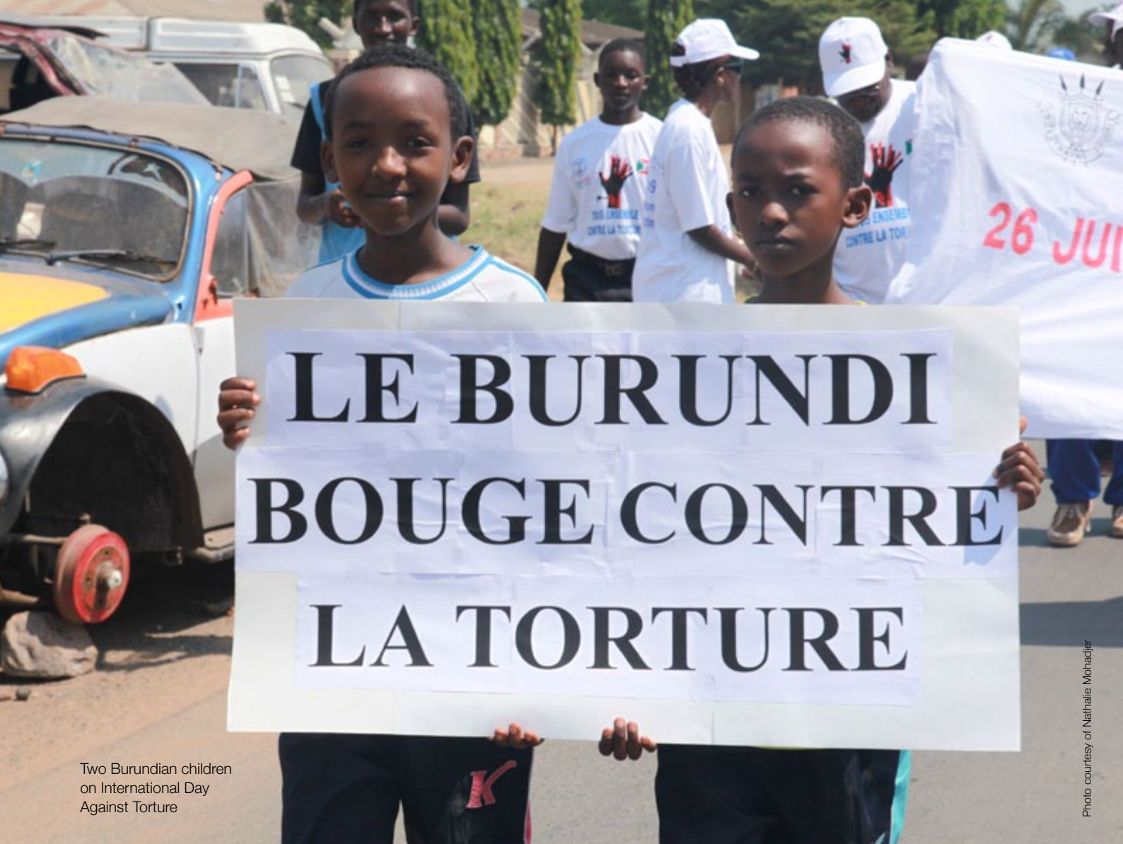
Two Burundian children on International Day Against Torture