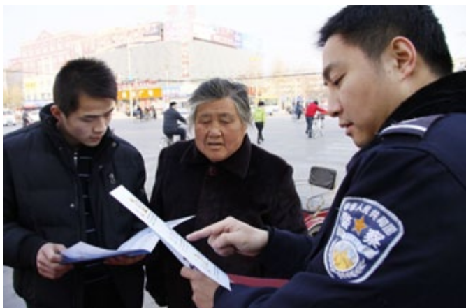
Police officer explaining the right to counsel to a resident of Liaocheng during a rights awareness campaign

from the Supreme People's Court in Beijing on how best to implement the new sentencing guidelines. With proper training, both new regulations will significantly enhance the role of defense attorneys in the criminal justice system.