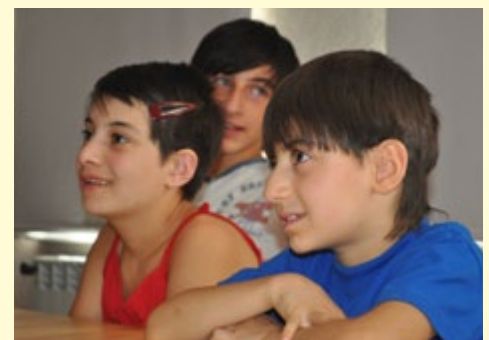
Georgian children learning about their basic human rights

about the legal system in Georgia, defines legal terms in a way that students can understand, and clearly highlights several important tenets of criminal procedure: the right to a lawyer, the right to remain silent, the right to receive medical care in custody, and the right to be informed of the charges against you.