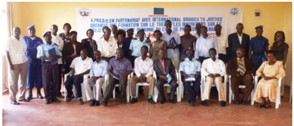
Participants in a criminal justice roundtable event at Rutana, Burundi

2010 Prison Population: 9,844, 114 per 100,000