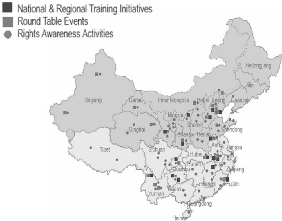
Figure 2. Since 2001, across the 31 provinces of China, IBJ has held over 50 round-table sessions, visited over 70 locations during rights awareness campaigns, and trained over 2000 people in over 50 training sessions.

improved training models, structures, and systems for the delivery of criminal legal aid services to the poor. The IBJ model aims to establish the creation of a core team of Chinese attorneys whose purpose is to train legal skills to other attorneys within and without their own Province. Once a core team of Chinese trainers selected from model centers is accomplished, IBJ's immediate support is no longer needed; instead, the core team and model centers are largely self-sufficient beacons of legal excellence (see Box: Sen Suxia).