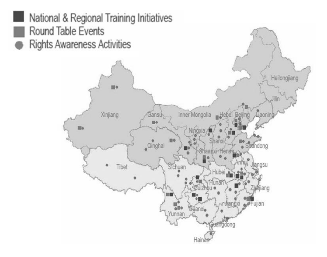
Figure 2. Since 2001, across the 31 provinces of China, IBJ has held over 50 round-table sessions, visited over 70 locations during rights awareness campaigns, and trained over 2000 people in over 50 training sessions.

improved training models, structures, and systems for the delivery of criminal legal aid services to the poor. The IBJ model aims to establish the creation of a core team of Chinese attorneys whose purpose is to train legal skills to other attorneys within and without their own Province. Once a core team of Chinese trainers selected from model centers is accomplished, IBJ's immediate support is no longer needed; instead, the core team and model centers are largely self-sufficient beacons of legal excellence (see Box: Sen Suxia).